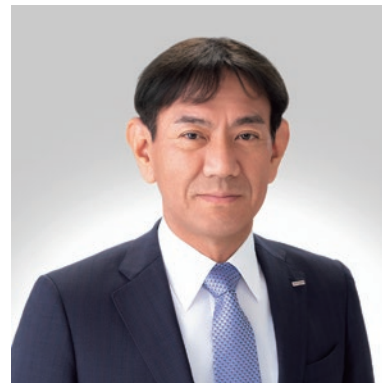
POKKA SAPPORO FOOD & BEVERAGE LTD. President and CEO